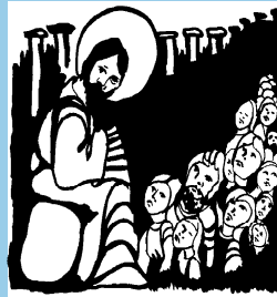
Jesus taught them as one having authority

In Deuteronomy today we hear that God's very words will fill the mouth of a true prophet, but a false prophet will, in a manner of speaking, put mere mortal words into God's mouth. In Mark's Gospel, we see Jesus teaching and healing as a true prophet, one filled with the authority of God's own voice, the Holy One of God. There are, no doubt, both false and true prophets around us today. The whole history of our church is filled with both. Some false prophets were extremely popular and quite well-versed in scripture, and even held positions of church authority. But in today's Gospel we learn that Jesus' fame spread because he taught with authority; he wasn't an authority because he was popular or famous. Elsewhere, we also learn from him, in his desert temptation confrontations with Satan, that anyone can quote scripture, even against God's purposes. Today we hear that his authority was not like that of the scribes, who held the official positions of religious authority in his day. Our work is to do our best to discern the true prophets in our midst, and to be true prophets as well. The psalmist tells us how to do this: by not hardening our hearts when God speaks. If we truly listen to God, it will be God's very words filling our mouths.